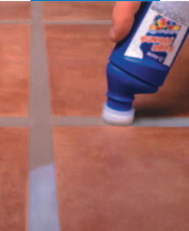
Floor in terracotta treated with Fuga Fresca